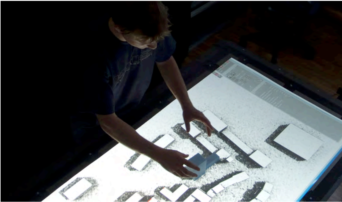
Figure 2. CDP at work – seamless connection between analogue and digital worlds

In contrast to typical Tangible User Interfaces, the objects are not solely used as an adaptation of the control system (whereby the geometry of the object can usually be ignored – see also Urp (Underkoffler and Ishii 1999)). Through the markerless, direct connection between the physical and digital worlds, the analogue objects are connected to the simulation not just in two dimensions but also as whole volumes, and as such become direct participants in the digital design scenario. A working model made of rigid styrodur foam is automatically scanned in three dimensions and incorporated into the 3D city model. The data basis for the semantic 3D city model is based on an Oracle database in City GML format. Using this newly created digital model, various analyses and simulations can be calculated and the results displayed. Changes to the form of the styrodur blocks, such as when they are trimmed or shaped, or changes to their position are updated directly in the scene, the simulation updating accordingly in real time.